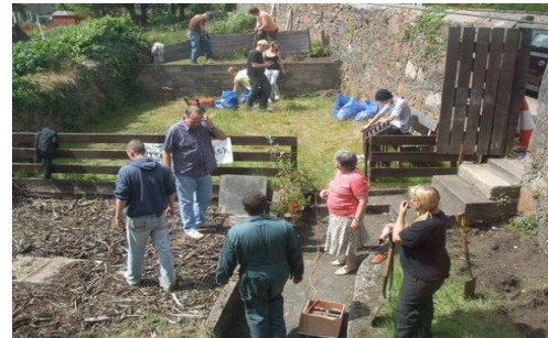
Groups coming together to help out

AVA & its Volunteers & Timebank volunteers have been working with Kintyre Youth Enquiry Service, Campbeltown Organic Garden & Dalintober Residents Association to tidy up & plant herbs/flowers in the Dalintober Millknowe Residents Association garden at Broom Cottage. A mix of young & old Volunteers & Timebank volunteers came together to prove just what you can do when working as a team.