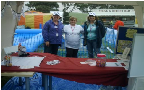
AVA & Volunteers at Agricultural Show